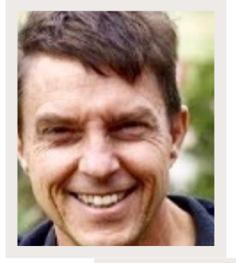
E I NR I CH